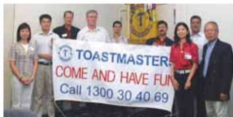
Toastmasters from Upper Mt Gravatt and other Toastmasters Clubs and PhD Students at the Workshop: