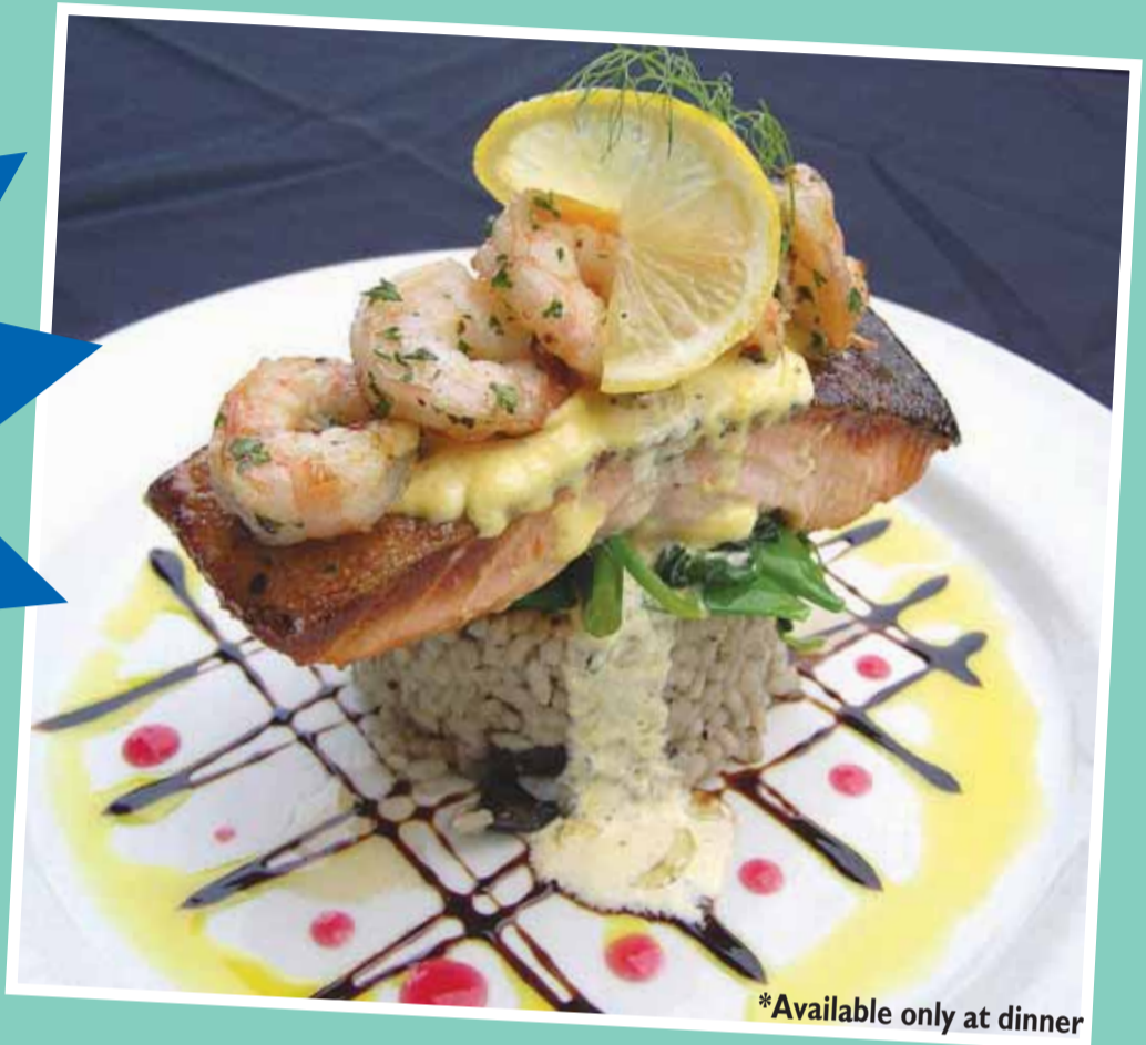
*Available only at dinner

Grilled Salmon with garlic prawns on mash or risotto, seasonal greens with hollandaise sauce – $23.90